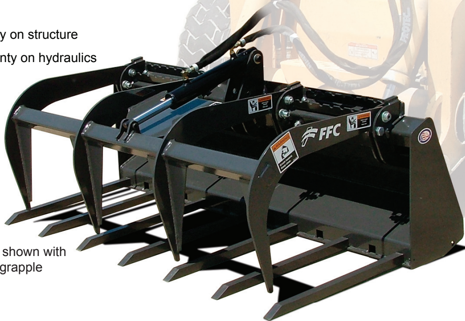
Model LAF1866 shown with optional bolt-on grapple