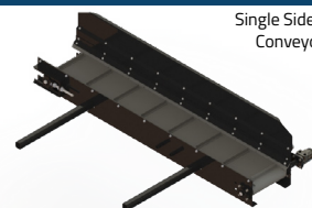
Single Sided Conveyor