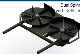
Dual Spinner with Deflectors