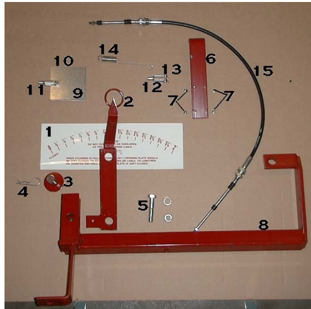
PARTS IN HYDRAULIC KIT 1000