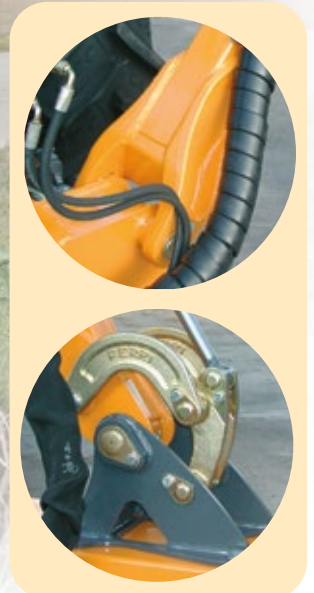
Drop forged arm brackets and flail head linkage.