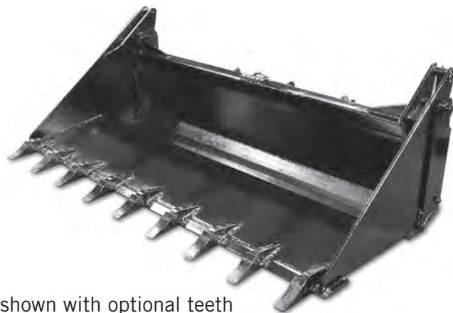
shown with optional teeth