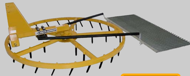
Shown with Optional Dragmat

Ideal for horse arenas and racetrack applications. A low profile harrow that rotates in a crisscross fashion to provide complete harrow coverage. The unique turning action allows the harrow to level soil by redistributing it inward. Available in 5', 6', 7', and 8' diameter models for tractors with Category 1, 3-point hitches. The heavy-duty 5 spoke rings are constructed of 2" x 2" tubing and equipped with 3/4" x 8" angled teeth to provide trash clearance.