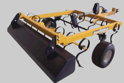
Shown with Electric Actuator

Designed to pull easily from All Terrain Vehicles to renovate and condition horse arenas. The 5' foot working width machine is equipped with two rows of S-tines and a heavy-duty rear leveling box. Arena-Vator Jr. is available with either an electric actuator and control box or manual link to adjust the height from transport into working position. This rugged built tool is equipped with high flotation tires and an adjustable clevis hitch. 1-7/8" ball hitch is optional. The S-tines vibrating action adds air to the soil to cushion the footing and the rear leveling box provides a smooth finish. Arena-Vator Jr. is ideal for maintaining uniform footing.