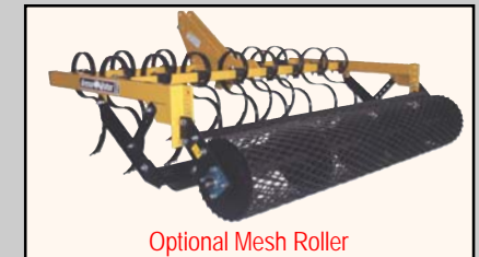
Optional Mesh Roller