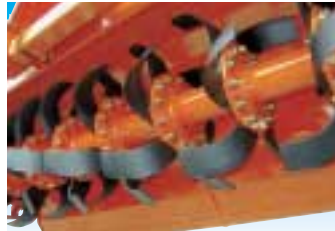
Detail rotor and blades