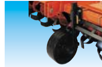
Twin depth control wheels (opt)