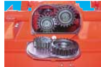
Multi speed gearbox, detail (opt)