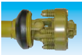
PTO shaft with slip clutch (std)