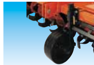
Twin depth control wheels (opt)