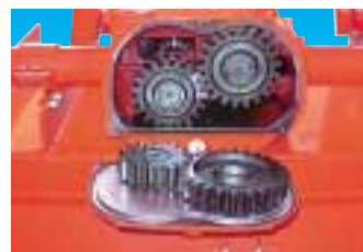
Multi speed gearbox, detail (std)