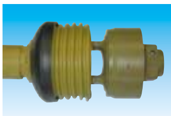
PTO shaft with cam clutch (opt)