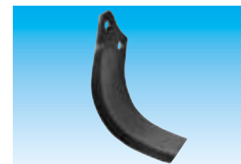
Detail of blade