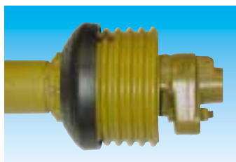
PTO shaft with shear pin (optional)