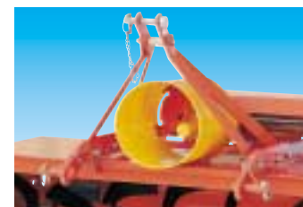
Universal three point hitch, cat. I