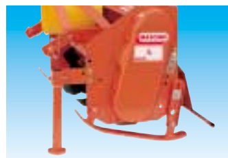
Skids for working depth adjustment