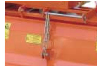
Rear door: chain