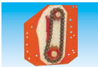
Chain side drive